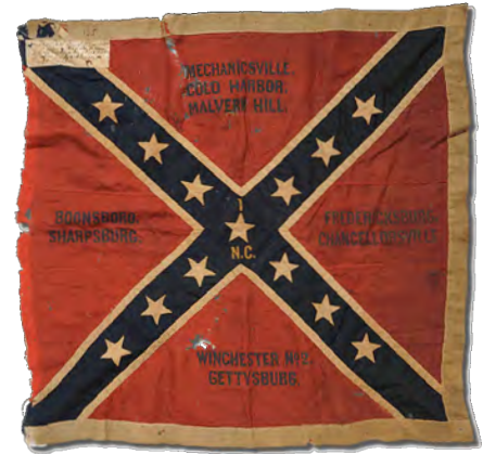
1st North Carolina State Troops Regimental Flag