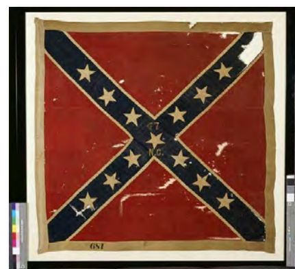
Image of 1914.252.3 (47 th Regiment); Before Treatment (left) and After Treatment (right) to humidify, clean, remove previous failed repairs, stabilize existing tears, and mount in a frame to support flag and provide UV protection.