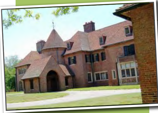
Adamsleigh estate in the Sedgfield neighborhood.