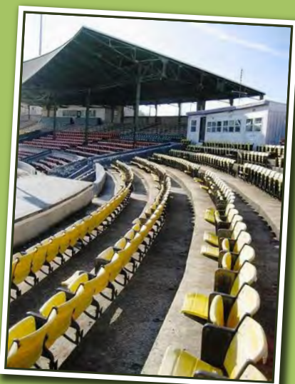
War Memorial Stadium on Yanceyville Street.