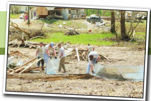
Volunteers clean up debris from the Elaney Wood House.