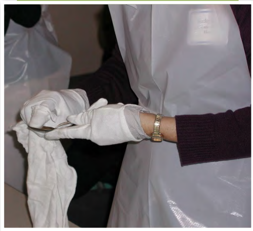
A "Collections Care Basics" participant practices polishing silver.