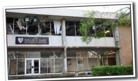
Damage to Shaw University from the tornado.