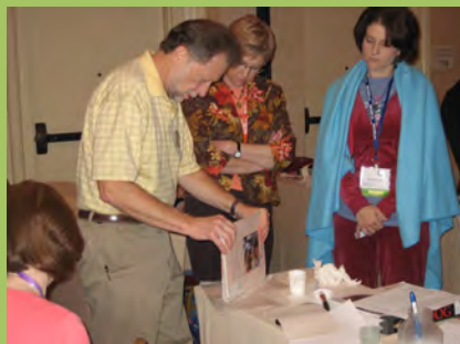
NCPC members participate in a book repair workshop.