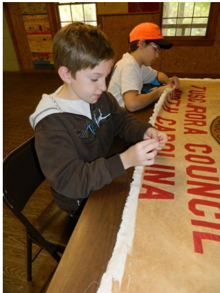
Members of Boy Scout Troop 57 repairing flags.

The Boy Scouts of America has been an important part of young men's lives for over 100 years and provides life skills and experiences in outdoor activities and adventures. Boy Scout Troop 57, based in Clayton, North Carolina contacted the East Carolina University (ECU) Conservation Lab to assist them in preserving three historic flags that are on display in the dining hall at Camp Tuscarora.