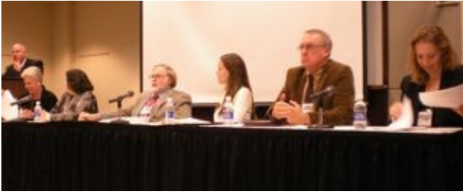
NCPC Annual Meeting panelists answer audience questions.

on Heritage Preservation's Conservation Assessment Program (CAP). CAP is an assistance program that provides general assessments for small and mid-sized institutions of all types. A CAP survey documents priorities and can be used to advocate for other funding.